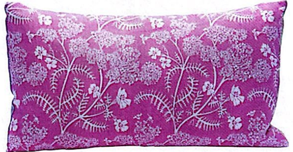
Linen cushion screenprinted with an Achillea millefolium design using natural dyes and pigments by Nicola Cliffe, £65, Madder Cutch & Co