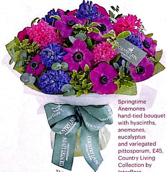
Springtime Anemones hand-tied bouquet with hyacinths, anemones, eucalyptus and variegated pittosporum, £45, Country Living Collection by Interflora