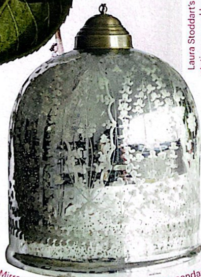
Mirrored-glass vintage-style dome ceiling pendant (44cm diameter), £245, Rockett St George