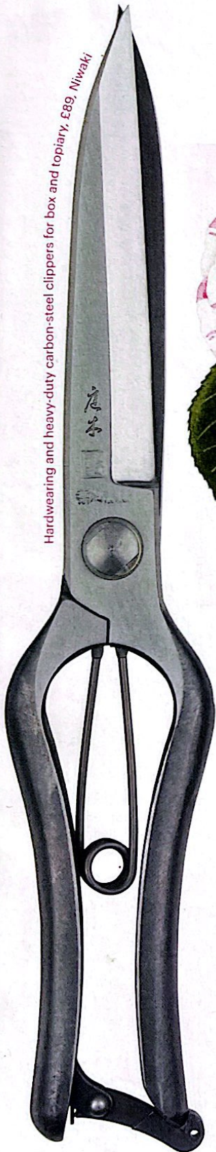
Hardwearing and heavy-duty carbon-steel clippers for box and topiary, £89, Niwaki