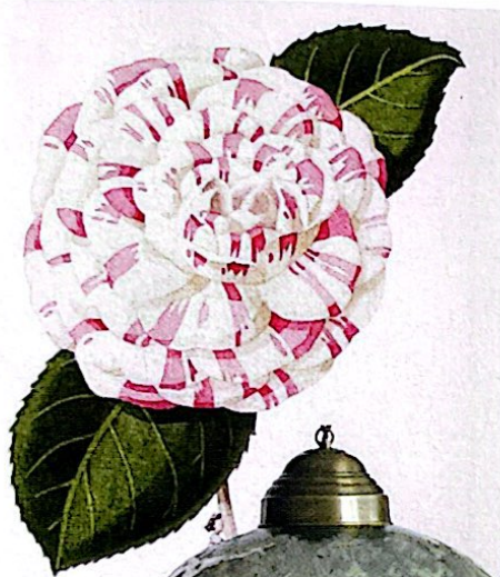
Laura Stoddart's delicate botanical illustrations feature on stationery and homeware, £10 for a pack of eight notecards